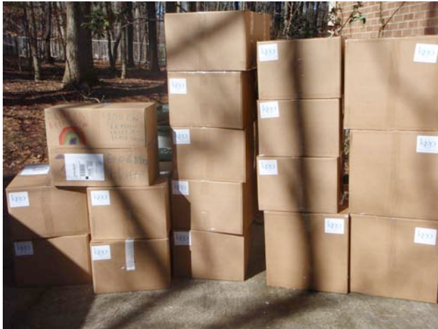
Boxes packed and ready to go

http://sharing.theflip.com/session/ff320ad25ab6e318be2e7dc828c09ab6/video/9718701