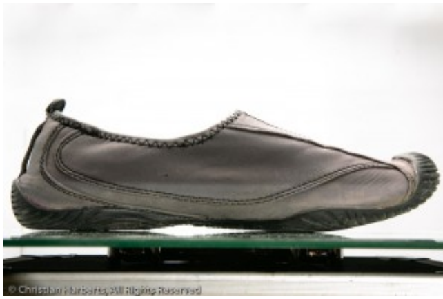
kigo edge - Minimalist shoe sole - Fine