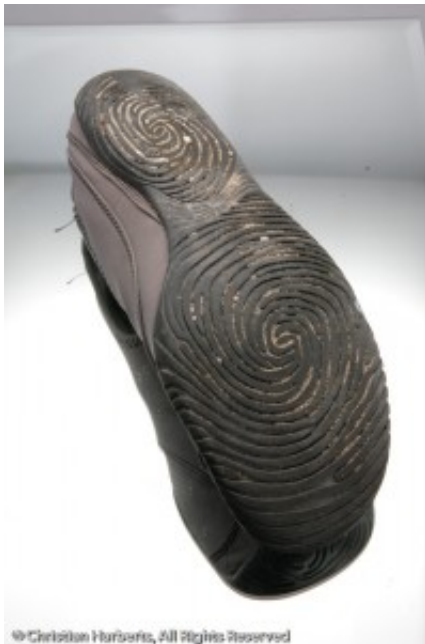
kigo edge - Minimalist Shoe - Sole and Heel

For minimalists, we seek at all costs to save the heel up running barefoot to learn how to ask after gently rolling phase on the front foot. Exit the heel on many minimalist shoes - Huarache sandals, the Soft Star Shoes RunAmoc LITEBlack are examples. Great was my surprise when I discovered a little extra thickness under the heel edge. These heels truly obsessed me since I have seen a relatively significant wear after only a dozen miles.